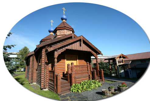
Часовня Всех Святых, г. Кодиак, Аляска

Saint Herman reposed in the Lord at the age of 81. An Orthodox Seminary in Kodiak, Alaska, is named in his honour. Venerable Herman was glorified in 1970.