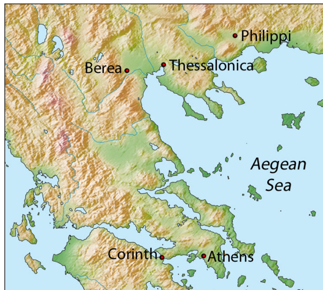
Географическое положение города Солунь на Балканском полуострове

great-martyr , n. ['greɪt 'ma:tə] великомученик myrrh-streamer , n. ['mɜ:ɪ 'stri:mə] мироточец regard , v. [rɪ'gɑ:d] почитать, уважать instead , adv. [ɪn'sted] вместо, вместо того (чтобы) possessions , n. [pə'zefəns] имущество blessing , n. ['blesɪŋ] благословение against all odds наперекор всем обстоятельствам enraged , adj. [ɪn'reɪdʒd] пришедший в ярость spear , n. [spiə] копье fragrant , adj. ['freɪgrənt] благоуханный, благовонный myrrh , n. [mɜ:ɪ] миро